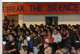
Students at Miguel Contreras Learning Complex sit in the...